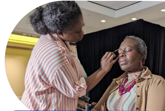
Breast Health Respite Retreat

Secured 2 years of funding for the Community Resource Network and the Faith Collaborative, CHWs.